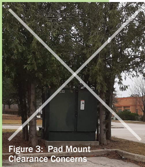
Figure 3: Pad Mount Clearance Concerns

In order to meet these requirements, coordination of all facilities within proximity of other UG equipment is essential.