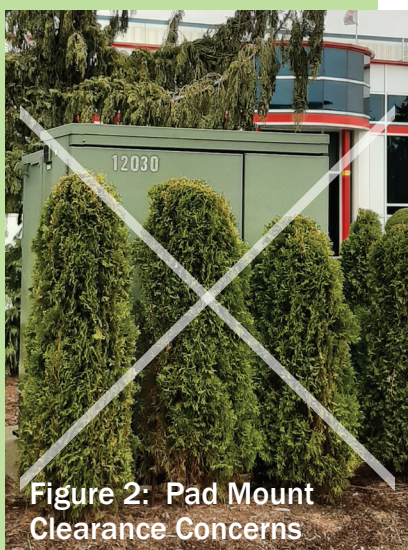
Figure 2: Pad Mount Clearance Concerns